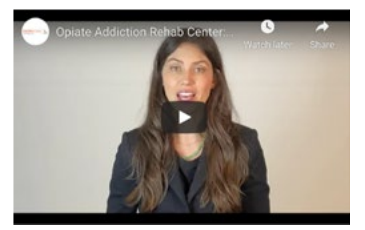
Click on the image to see the video.